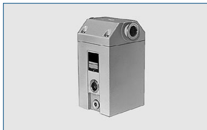
AF 4-8 exhaust filter

Exhaust filters retain oil mists and aerosols.