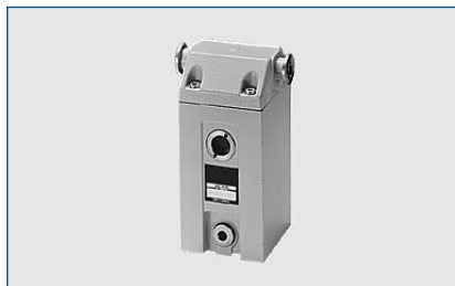
AK 4-8 condensate separator

Separators protect the pump against condensate.