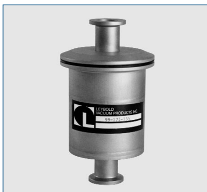
RST refillable trap

The RST traps are made from 304 stainless steel, and when specified with stainless steel filtration media, are fully suited for corrosive applications. The media is inserted directly into the trap. This ensures direct contact with the trap walls. There is no oil path between the trap wall and the retainer gasket to reduce trap effectiveness.