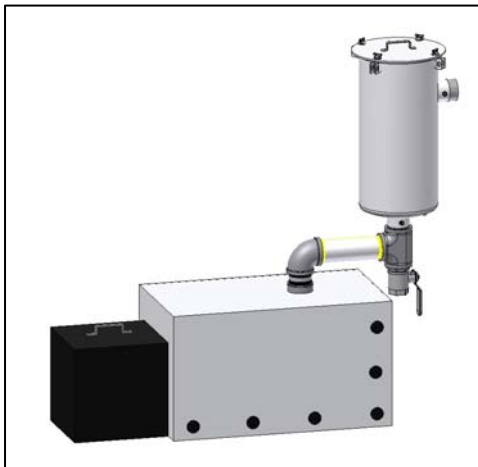
Preferred Installation Method